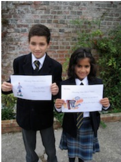
Players of the match.